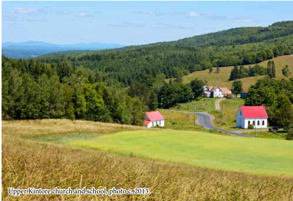
Upper Kintore church and school, photo c. 2013.