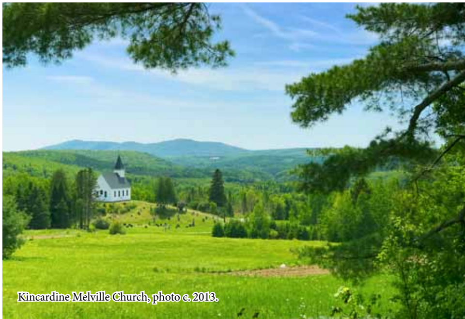
Kincardine Melville Church, photo c. 2013.